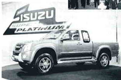
The new Isuzu D-MAX (left) and MU-7 (right) were presented to some 1,100 guests during a gala reception in Bangkok.